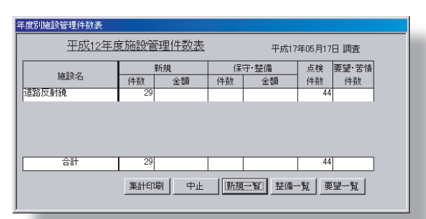
Facility summary sheet