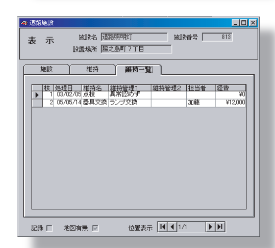
Facility maintenance data list